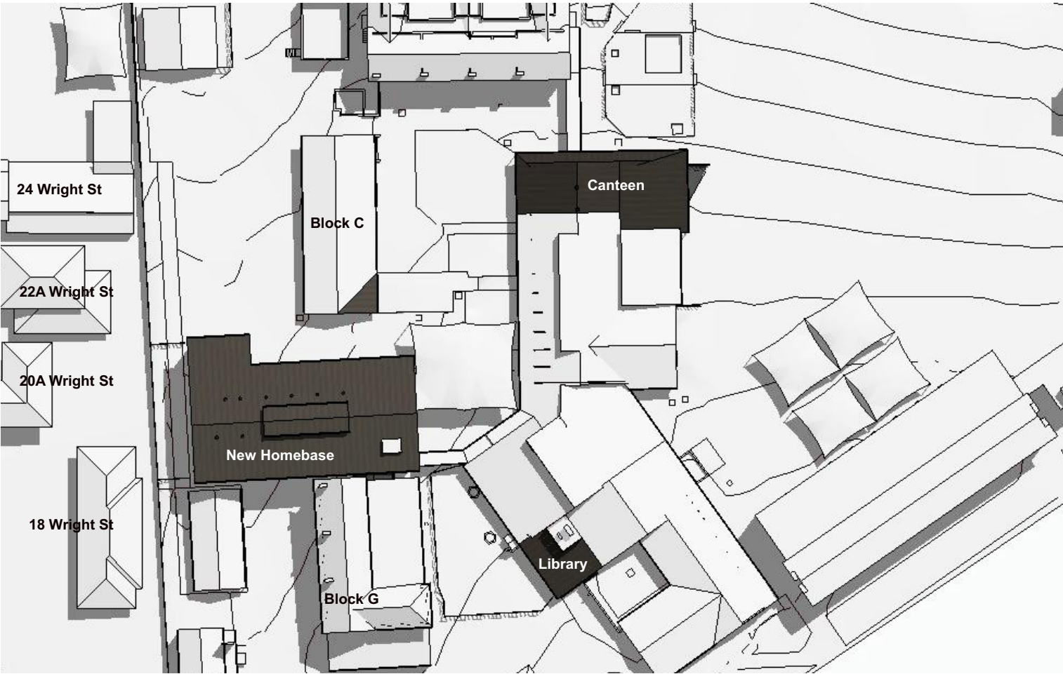
22 March 1200