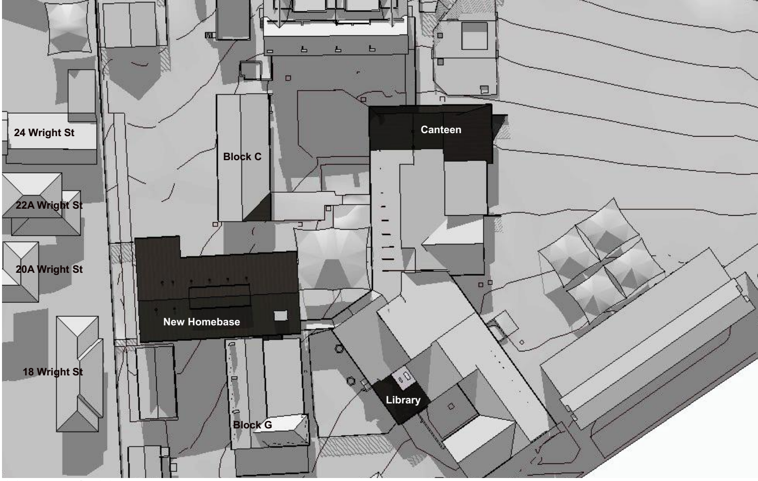
22 June 1500