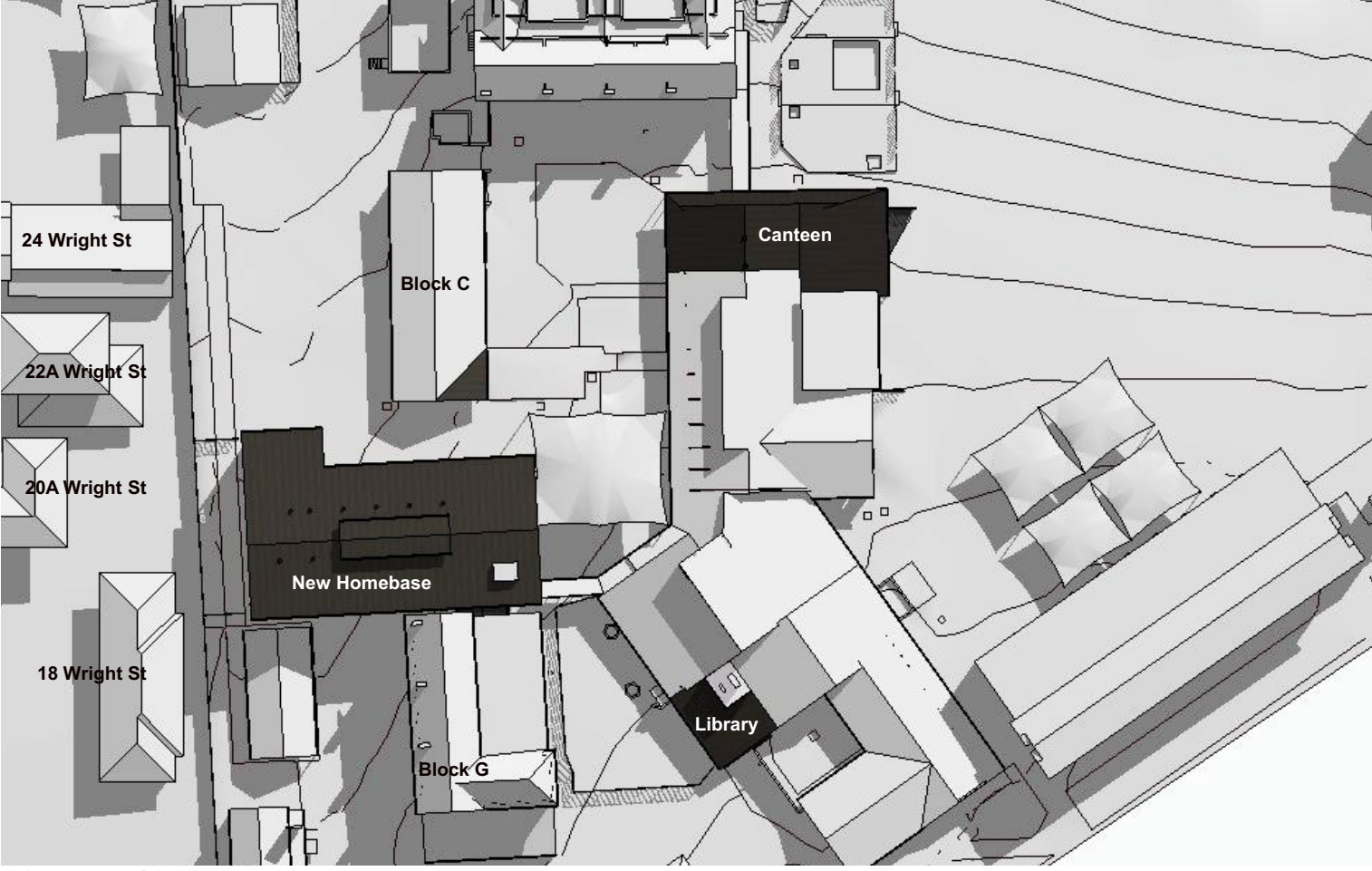
22 June 1200