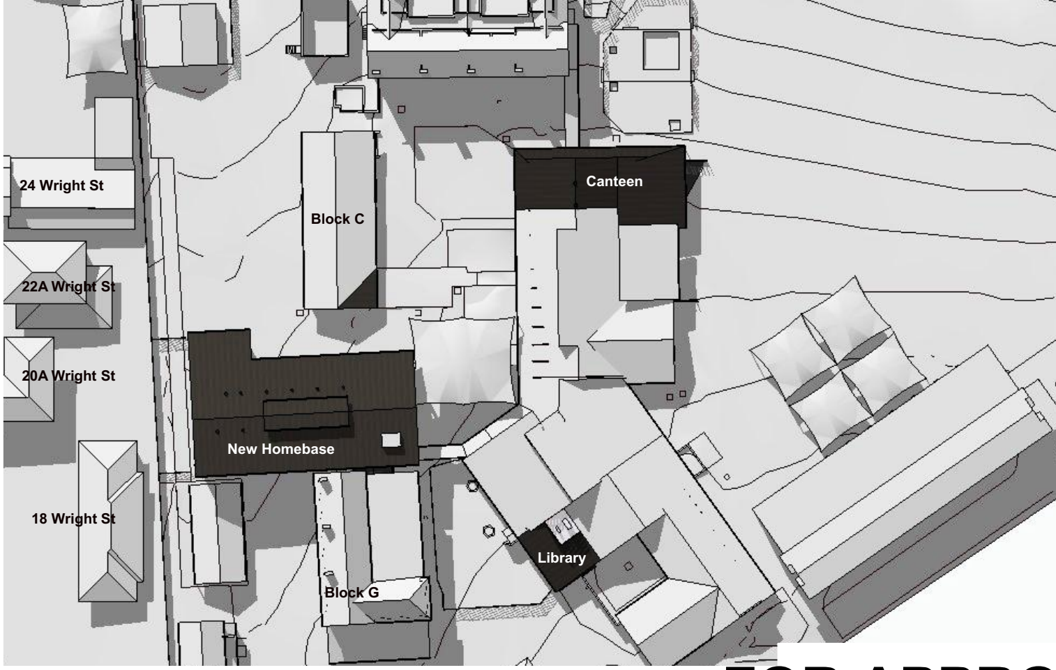
22 September 1500