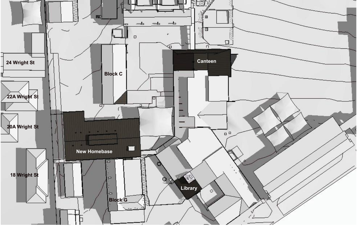
22 September 0900