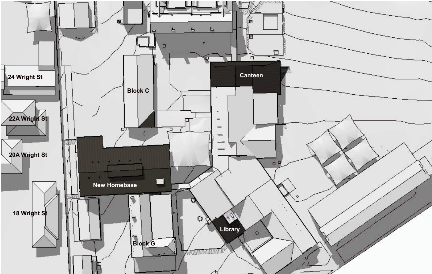
22 March 1500