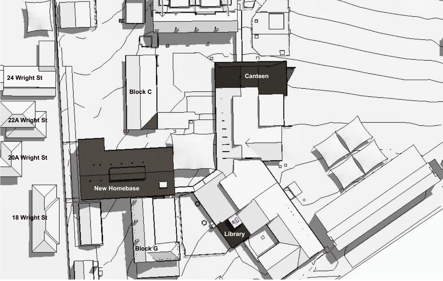
22 September 1200