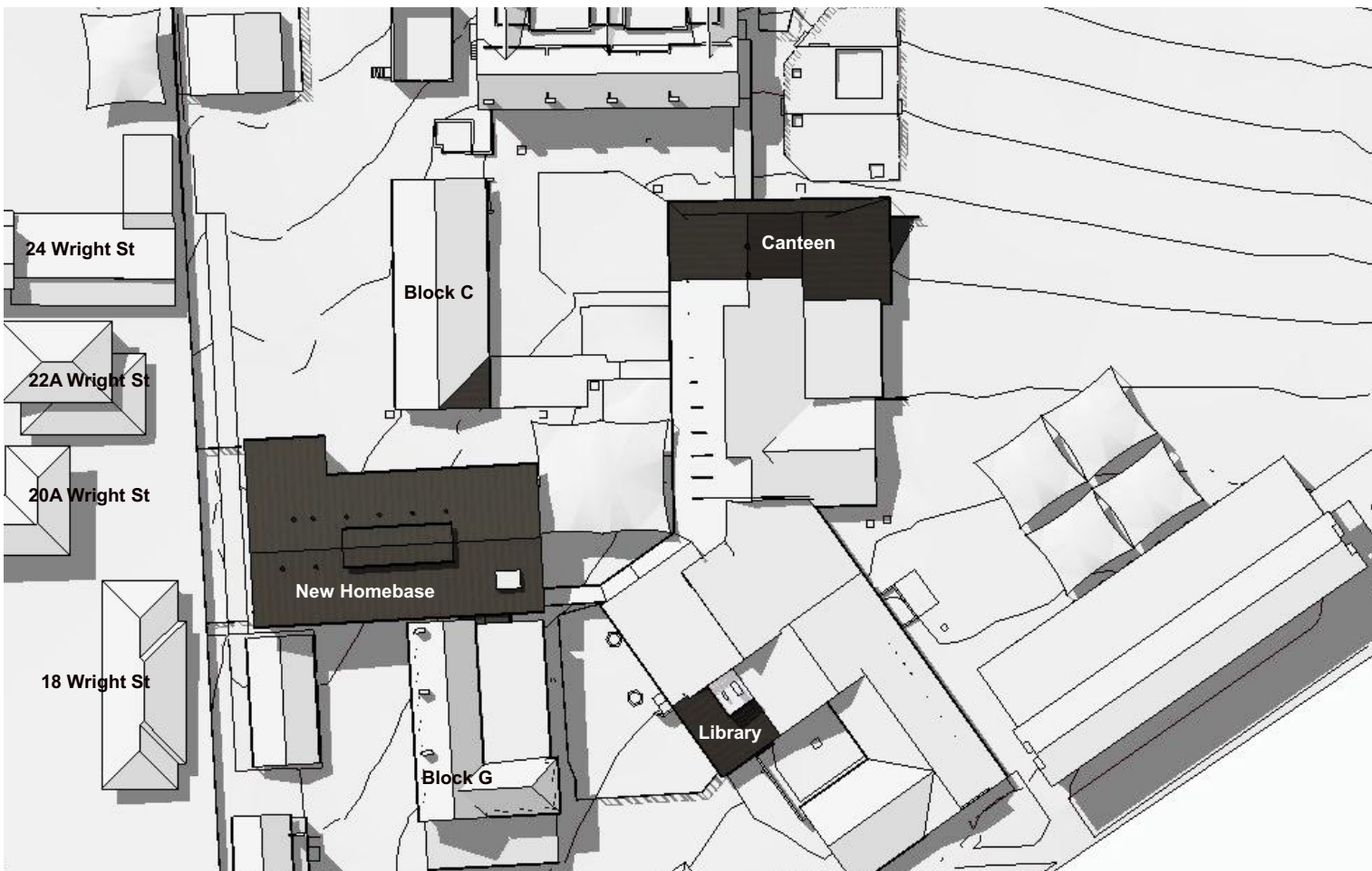
22 January 1500