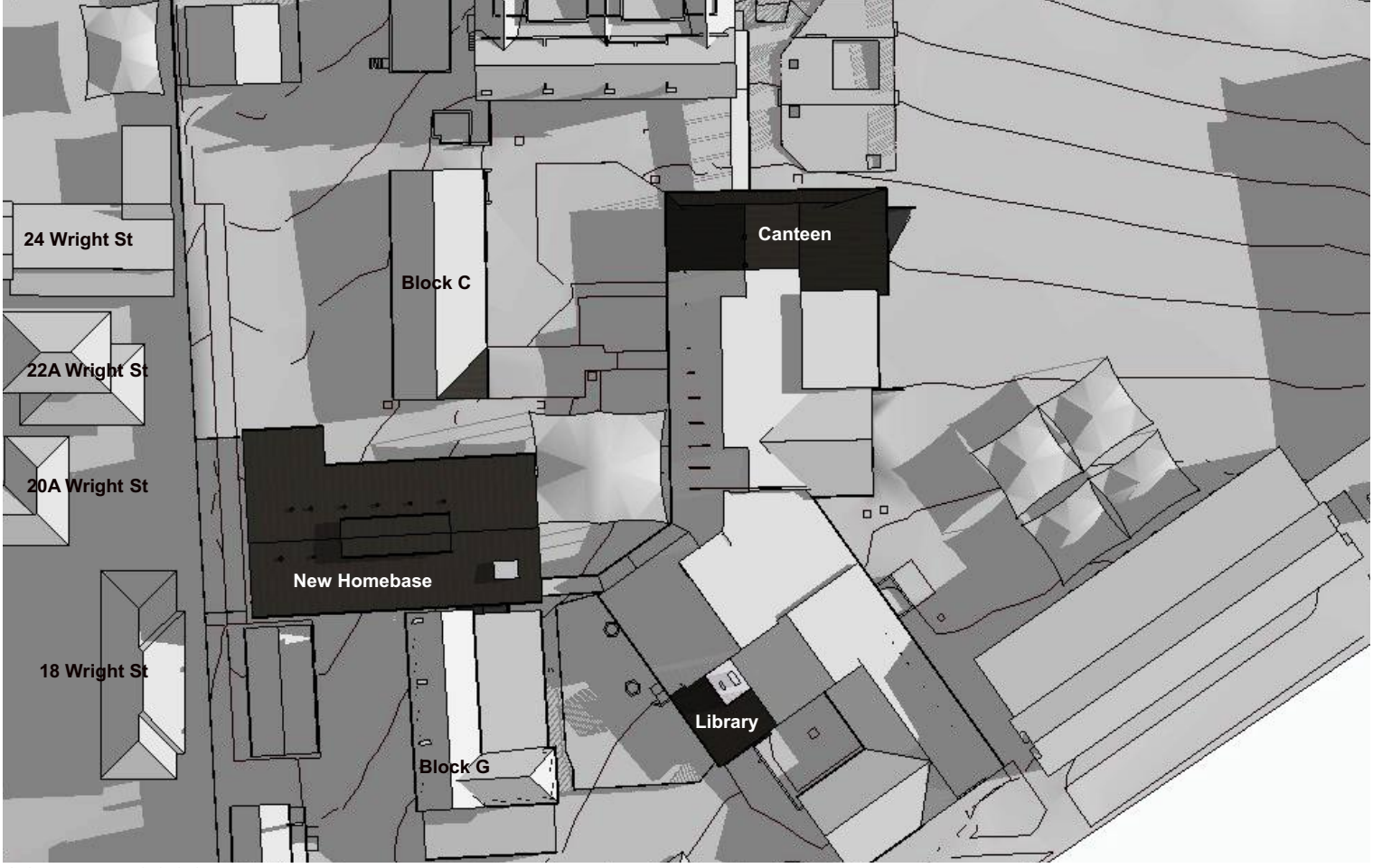
22 June 0900