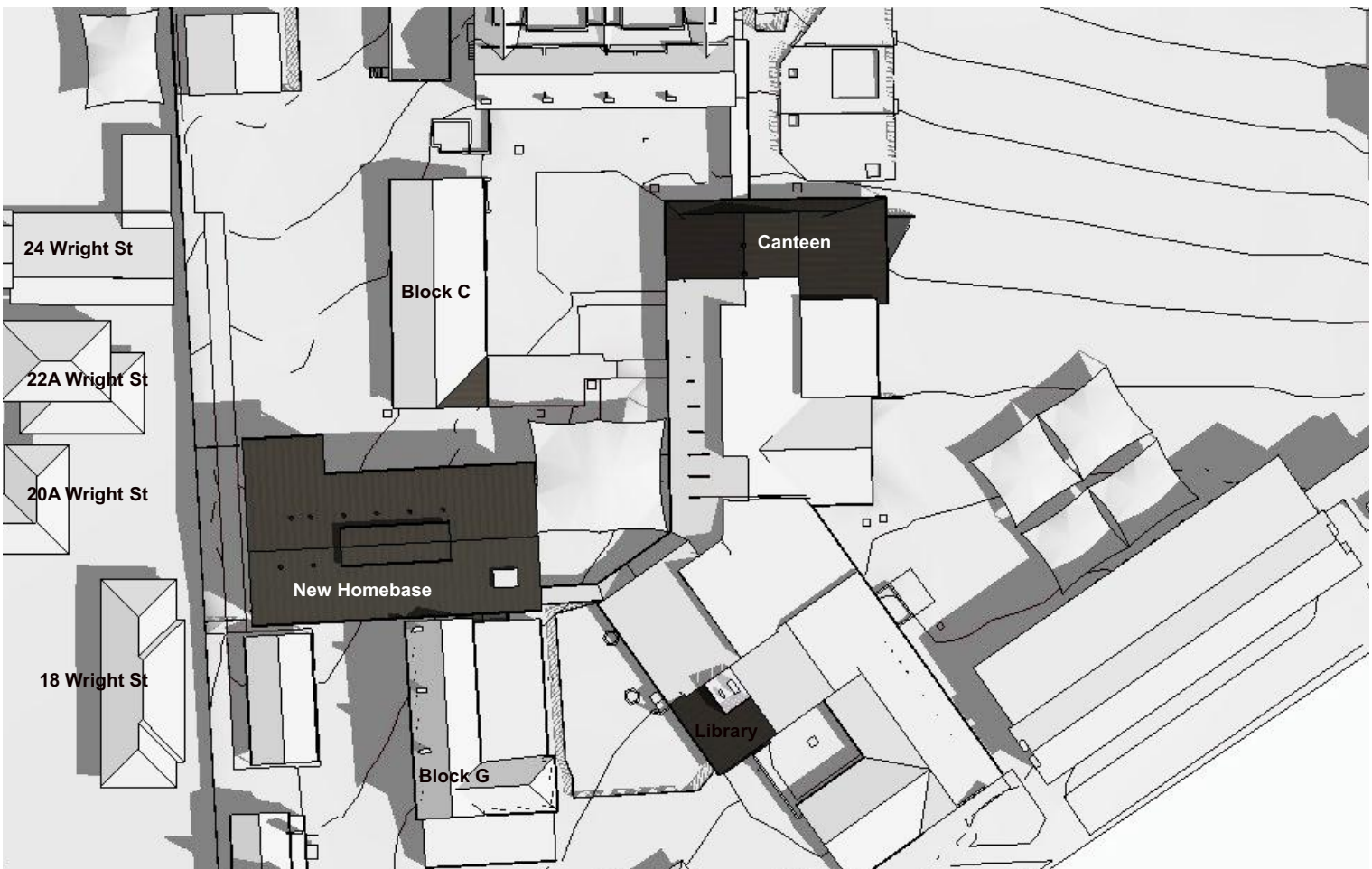
22 January 0900