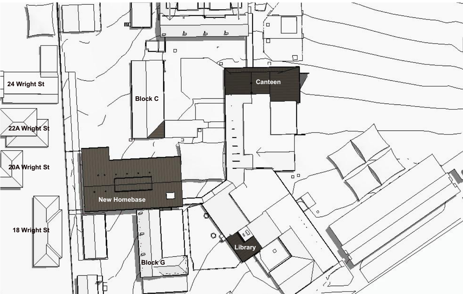
22 January 1200